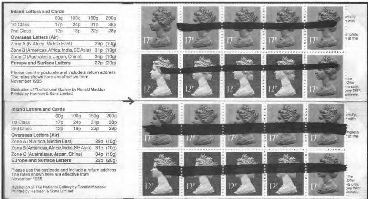
DP85 - showing the defacing felt tip marks