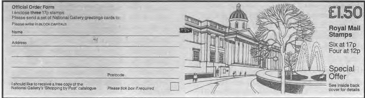
DB11(17) - outside cover show the National Gallery, greetings card offer

The first two of these items are illustrated and described on the next couple of pages, other items will appear in future Journals.