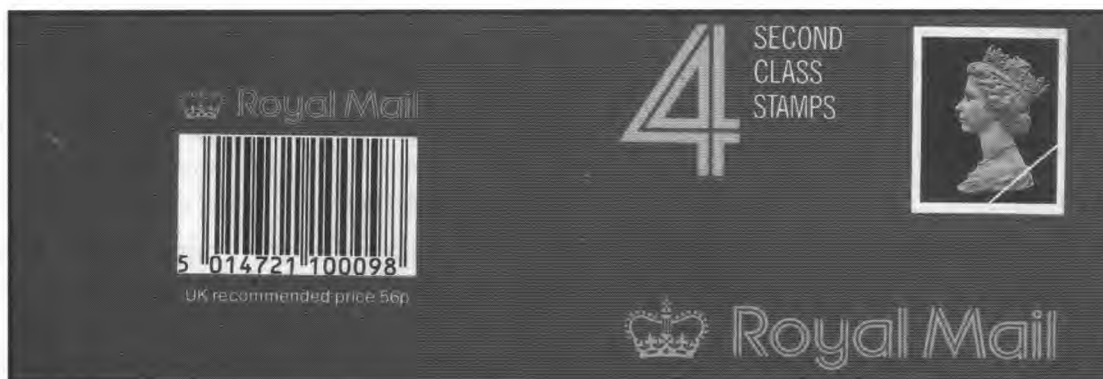
Dummy cover showing the type 3 design