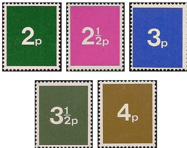
The five values of issued training labels